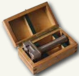
Control rod, Macro