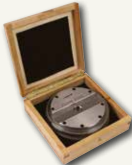
Control ruler, MacroMagnum