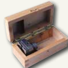
Measuring probe, Macro