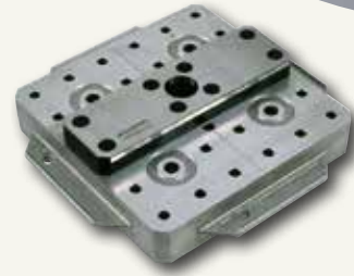
Master pallet, GPS 240