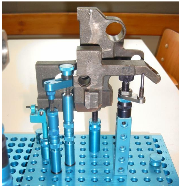
Alumess for cast iron part

ALUMESS clamping solutions enable precise and reproducible setups of clamping devices for different workpieces of all industries. They are designed for the flexible use at the measuring station, on coordinate measuring machines as well as on optical measuring systems.