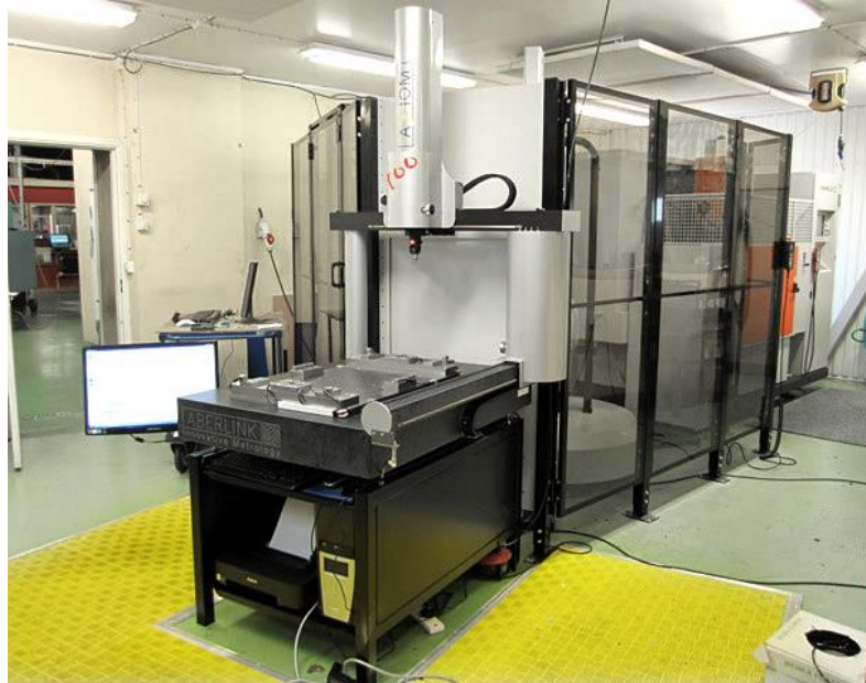
System 3R WorkMasTer serving WEDM machine and measuring machine.

CMM can be used as measuring machine and also as loading / unloading station for the cell. Tooling on the CMM is identical with the tooling on the RF440 WEDM machine.